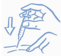
Figure A: Lightly pinch the skin and inject as instructed