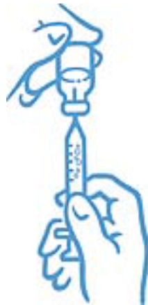
Figure 6: Remove air bubbles and refill syringe