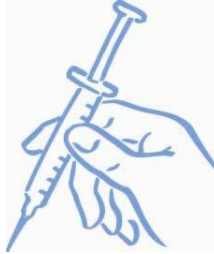
Figure 7: Ready to inject