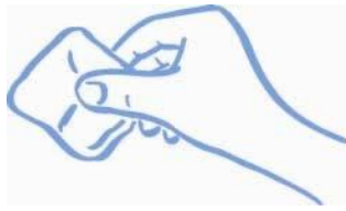
Figure B: Press (don't rub) with gauze or cotton