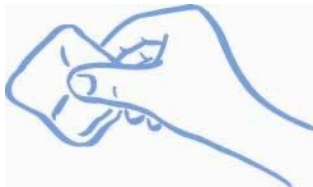
Figure B: Press (don't rub) with gauze or cotton