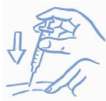
Figure A: Lightly pinch the skin and inject as instructed