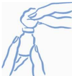
Figure 1: Wipe top with alcohol