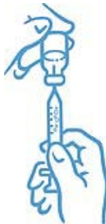
Figure 6: Remove air bubbles and refill syringe