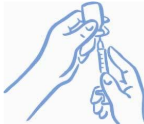
Figure 3: Prepare for extraction