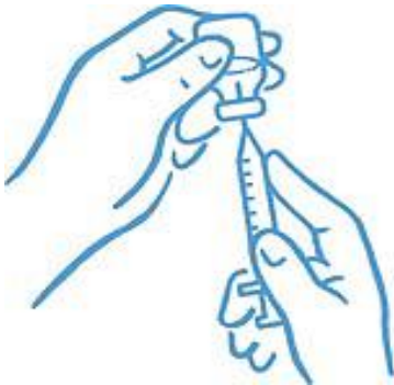
Figure 4: Tip in liquid